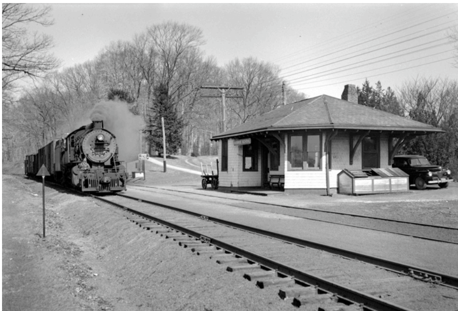
Top: Boarded up NK tower stands at the Newtown Branch crossing of the West Trenton branch at Bethayres, Pa Middle: Pacific #178 passes Mainline Jct. tower at Norristown, Pa. with an eastbound train. Left: Freight on the Newtown branch passing George School station.